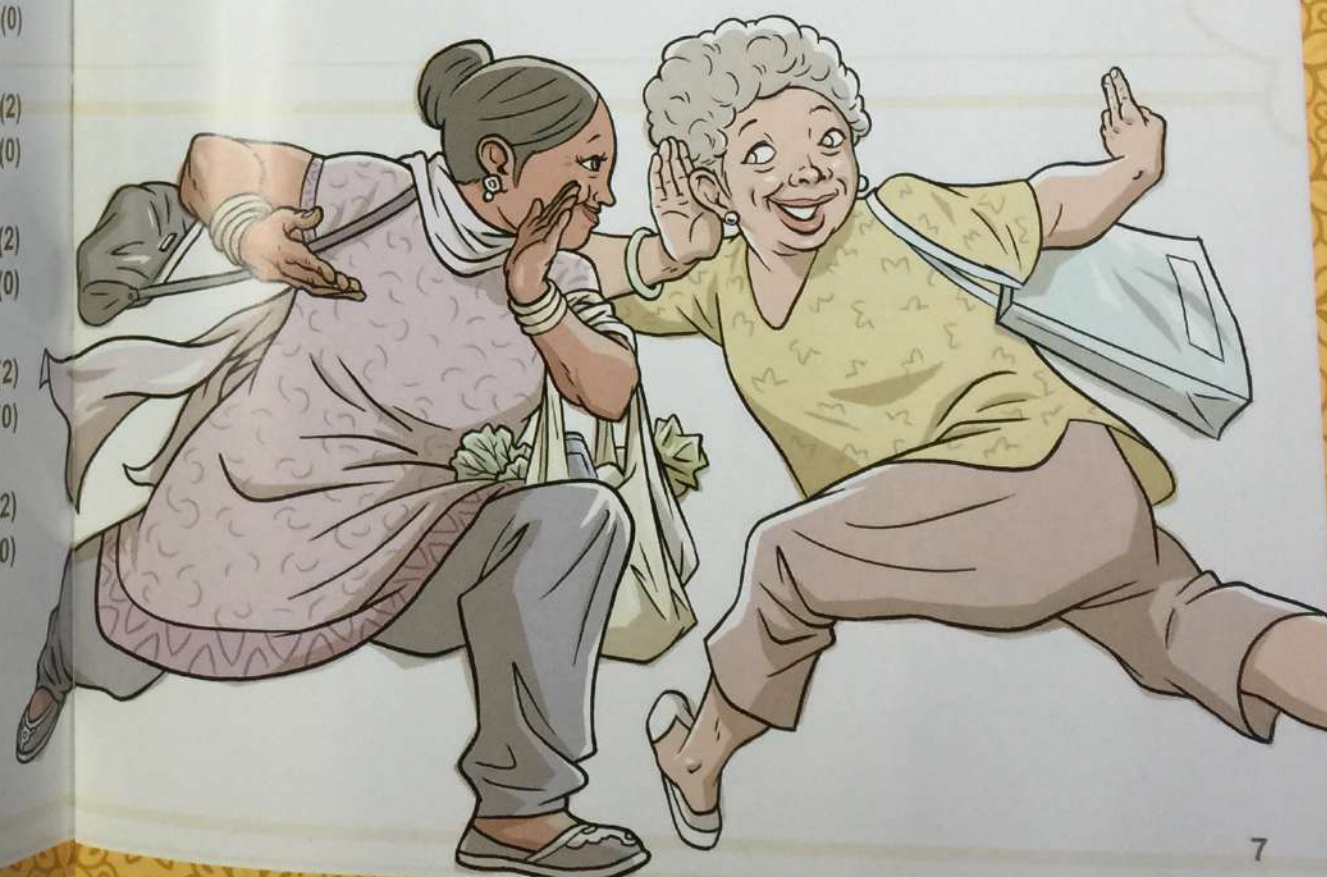
A hearing questionnaire in the test kit.

About 760 test kits were given out to elderly residents at a community event in Bedok on Sunday. Another 5,000 kits will be given out at various locations starting January 2017, at events and accident hotspots like Serangoon, Toa Payoh and Chinatown.